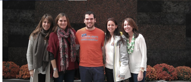
Marymount Manhattan College