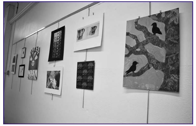
Oyster Bay High School's new art wing features an array of beautiful artwork from current students and alumni.