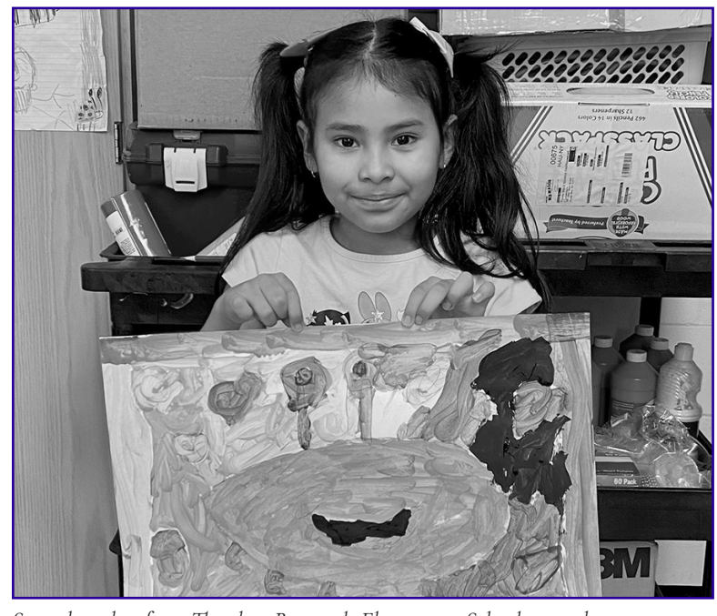
Second graders from Theodore Roosevelt Elementary School created sea creature artwork as part of their Under the Sea Blacklight Project.

The Oyster Bay-East Norwich Central School District is a proud supporter of the Arts and the importance that it plays in one's education. Students across all three buildings have showcased their talents in fine, multimedia and performance art this school vear.