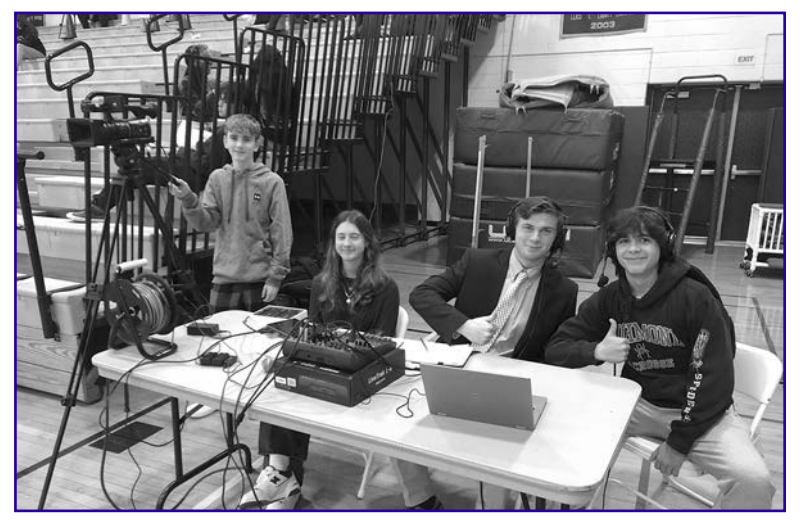
Students from Baymen TV work together to livestream one of Oyster Bay High School's home games.