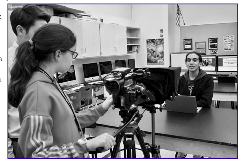
Students at Oyster Bay High School film Bay News Now after school.