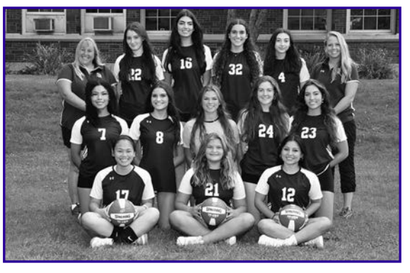
The Oyster Bay High School Girls Volleyball Team won the Nassau County Class C Championship for the second consecutive year.

Our athletes also achieved greatness in the classroom. The District was thrilled to have seven fall athletic teams earn the Scholar-Athlete title. When a high school team achieves a grade point average of 90 or above, they are designated as a Scholar-Athlete Team by the New York State Public High School Athletic Association. Congratulations to the following Fall 2022 teams for earning this recognition: Boys Cross-Country, Field Hockey, Football, Girls Cross-Country, Girls Soccer, Girls Tennis and Girls Volleyball.