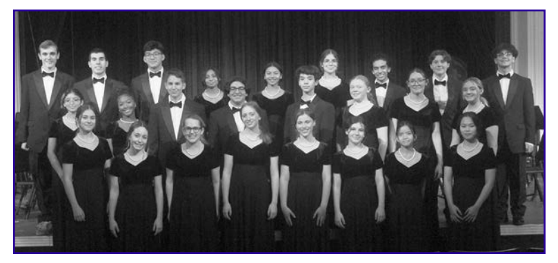
The Oyster Bay High School Chamber Singers traveled to Manhattan to open for the Rockettes at Radio City Music Hall.