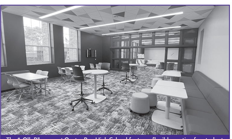
The "cOllaB" space at Oyster Bay High School features flexible seating for students to work together.

To stay up to date on the process of the 21stcentury improvement projects, please follow the Oyster Bay-East Norwich Central School District on Facebook, Instagram and Twitter. The handles can be found on page 4 of this newsletter.