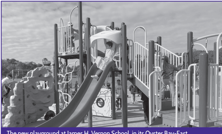
The new playground at James H. Vernon School, in its Oyster Bay-East Norwich purple and yellow, is being utilized to the fullest by students.