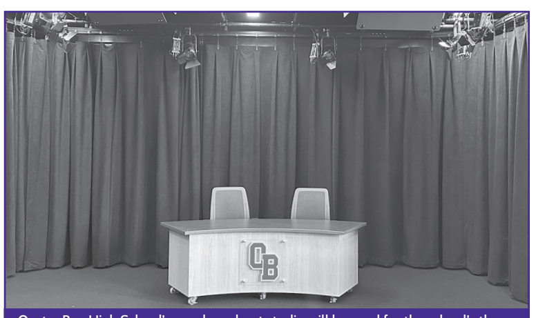
Oyster Bay High School's new broadcast studio will be used for the school's three broadcasting courses, as well as for the "Bay News Now" morning broadcast.